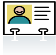
Photo ID and the nature of your visit are required. You will NOT be allowed in the building or to pick up your child if you do NOT have photo ID.

No child should be picked up later than 3:40 pm. Evans buses leave approximately at 3:45 pm. If you are not here to pick up your child, they will be put on the bus.