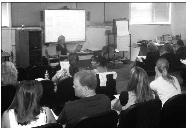
Fourth Grade Summer Institute took place on Aug. 2-6 at Ketcham High School